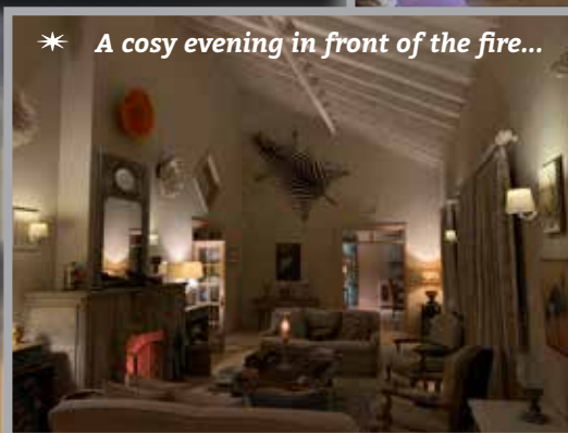
* A cosy evening in front of the fire...