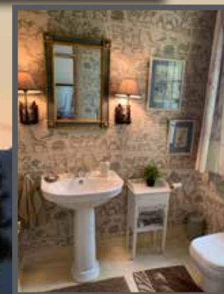
* Mount Kenya viewed from Ol Bobongi House