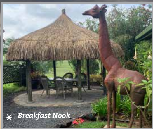
* Breakfast Nook