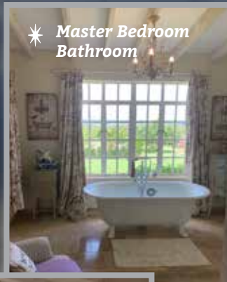
* Master Bedroom Bathroom