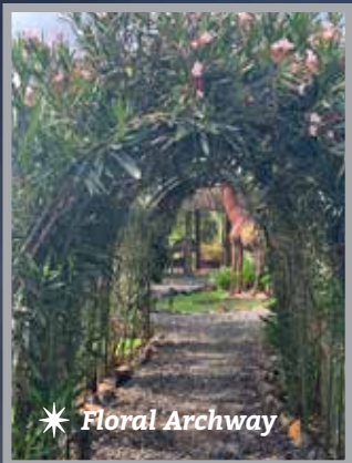
* Floral Archway