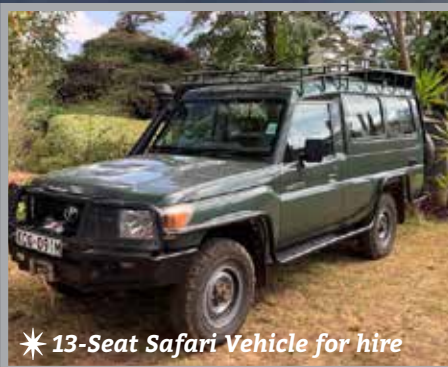
* 13-Seat Safari Vehicle for hire