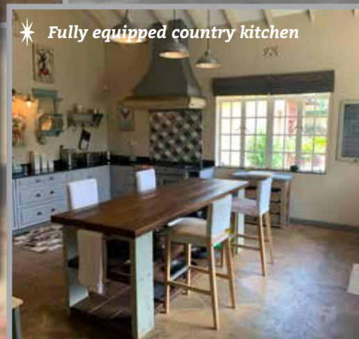
* Fully equipped country kitchen